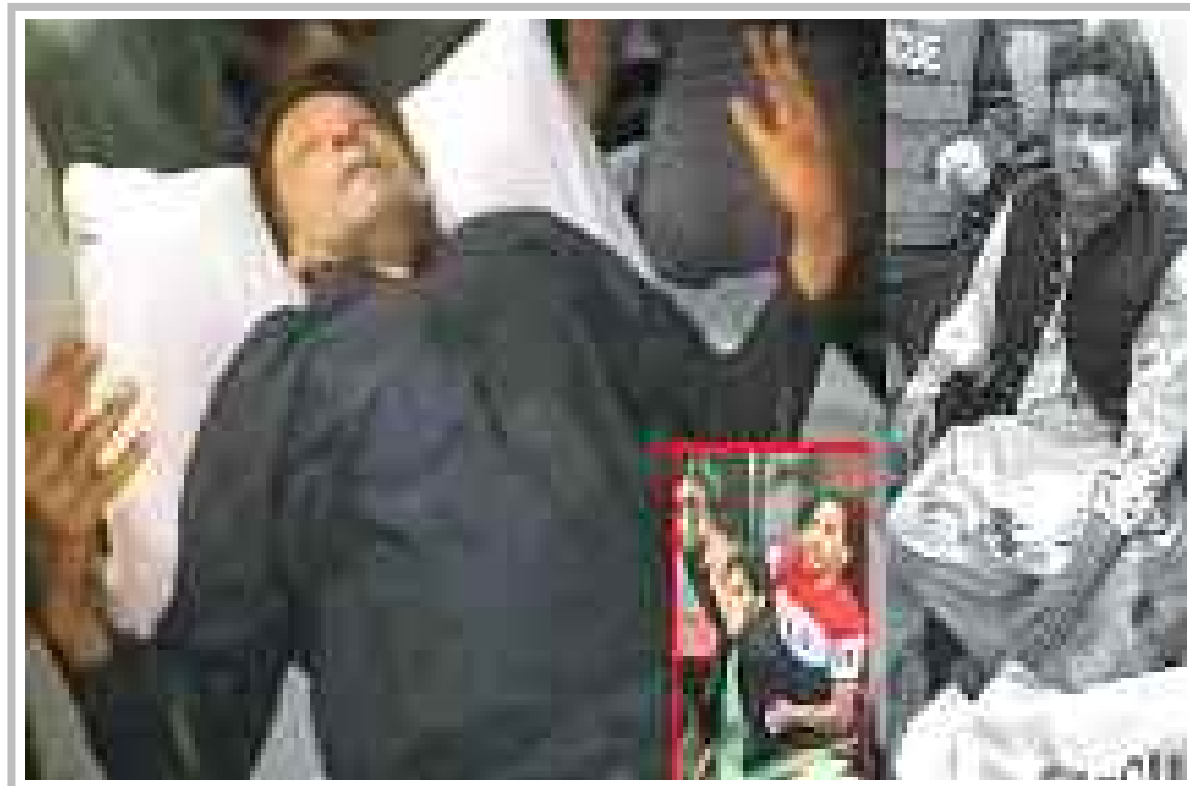
WAZIRABAD: Pakistan Tehreek-e-Insaf (PTI) Chairman Imran Khan after attack on his container.