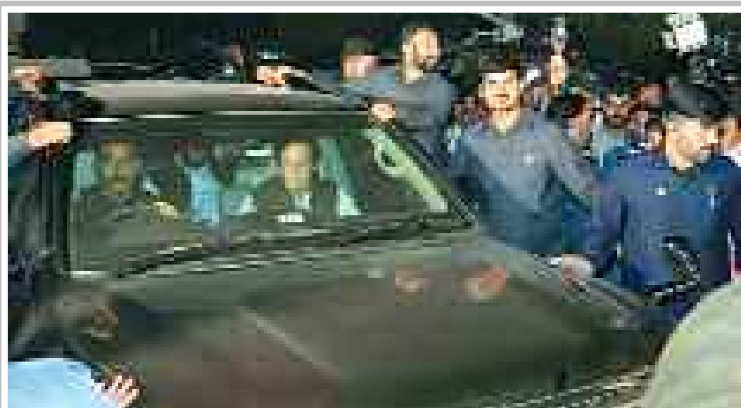
LAHORE: Punjab Chief Minister Ch Parvez Elahi coming to Shaukat Khanum Hospital to inquire after the health of Chairman PTI Imran Khan.

On the direction of Chief Minister Punjab Chaudhry Parvez Elahi, an environmental emergency has been imposed across the province to prevent from the hazards of smog.