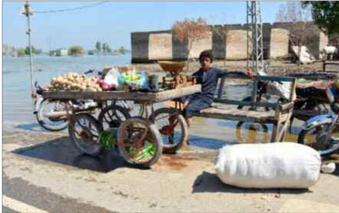
SEHWAN: A boy vendor waits for customer for selling vegetable near the flood-hit area.

ANKARA: Turkish President Tayyip Erdogan said on Wednesday his ruling AK Party (AKP) could put a constitutional amendment protecting women's right to wear headscarves to a referendum if it was not passed by parliament. The AKP was set to present the reform to parliament as soon as parties step up efforts to appeal to voters ahead of presidential and parliamentary elections set for June with polls showing dwindling support for Erdogan and the AKP. However, the secularist CHP revived the issue last month with a proposal to enshrine the right to wear headscarves as it reached out to devout Turks, having long opposed the wearing of headscarves in parliament and public offices. In response, Erdogan raised the stakes by proposing a constitutional reform on the issue encompassing measures to protect the family from what he called "perverse trends," appearing to take aim at global same-sex marriage laws. Pelosi attack suspect was on 'suicide mission': The man accused of attacking the husband of