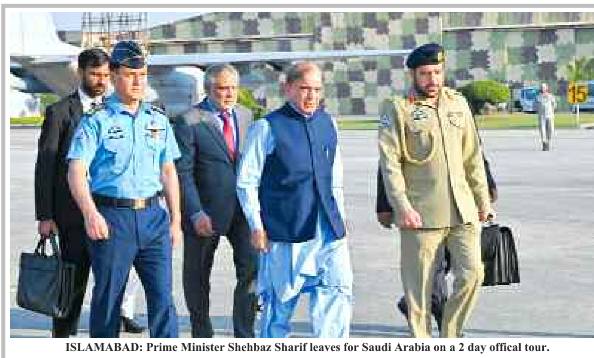
ISLAMABAD: Prime Minister Shehbaz Sharif leaves for Saudi Arabia on a 2 day official tour.

The interim bail has been granted against surety bond of Rs 100000.