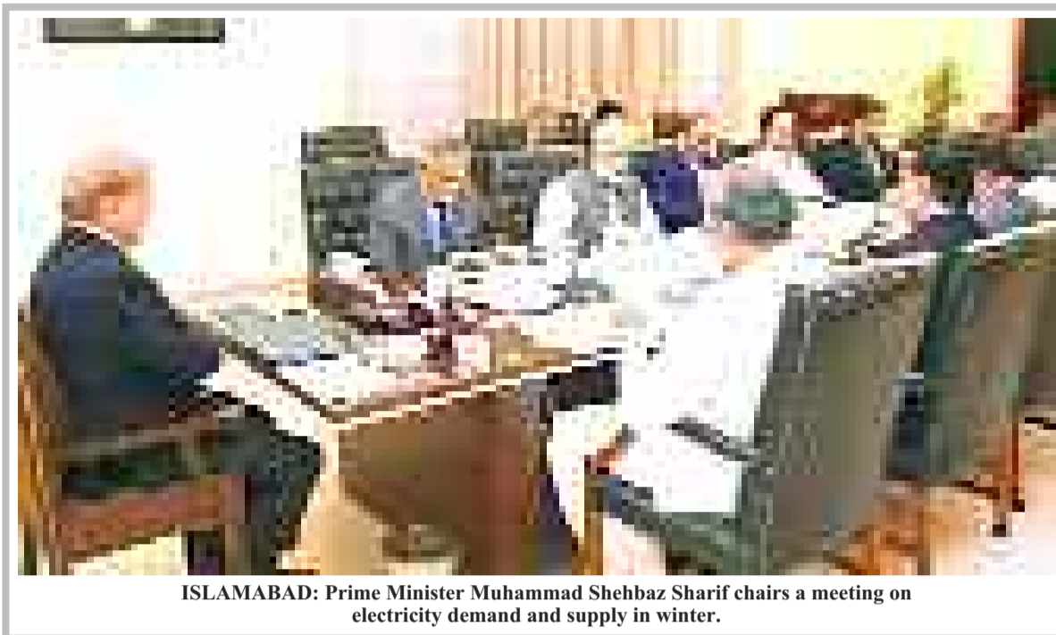
ISLAMABAD: Prime Minister Muhammad Shehbaz Sharif chairs a meeting on electricity demand and supply in winter.