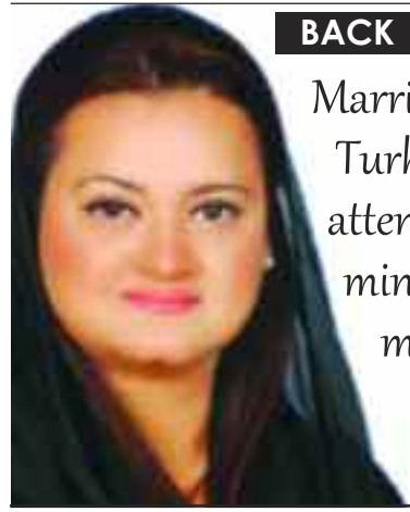
Marriyum in Turkiye to attend OIC ministers moot