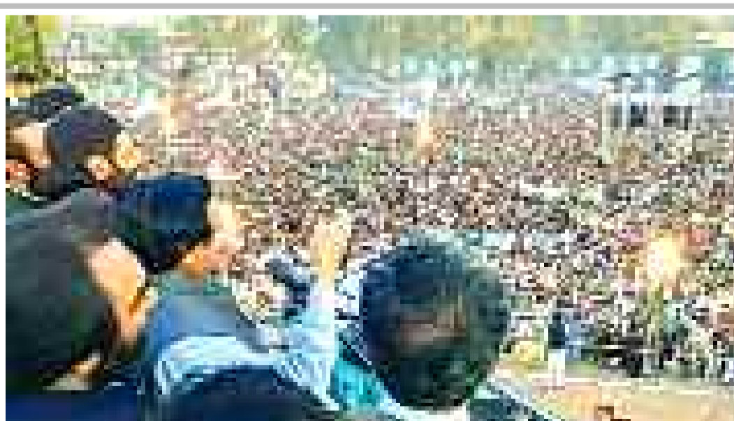
LAHORE: Punjab Chief Minister Ch Parvez Elahi addresses a big public meeting at Talagang.