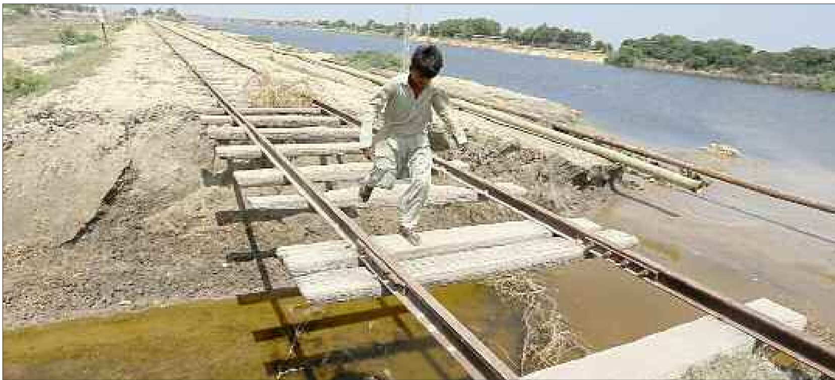
HYDERABAD: A youngster walks on a damaged railway track in flooded affected area at TM Khan Road.