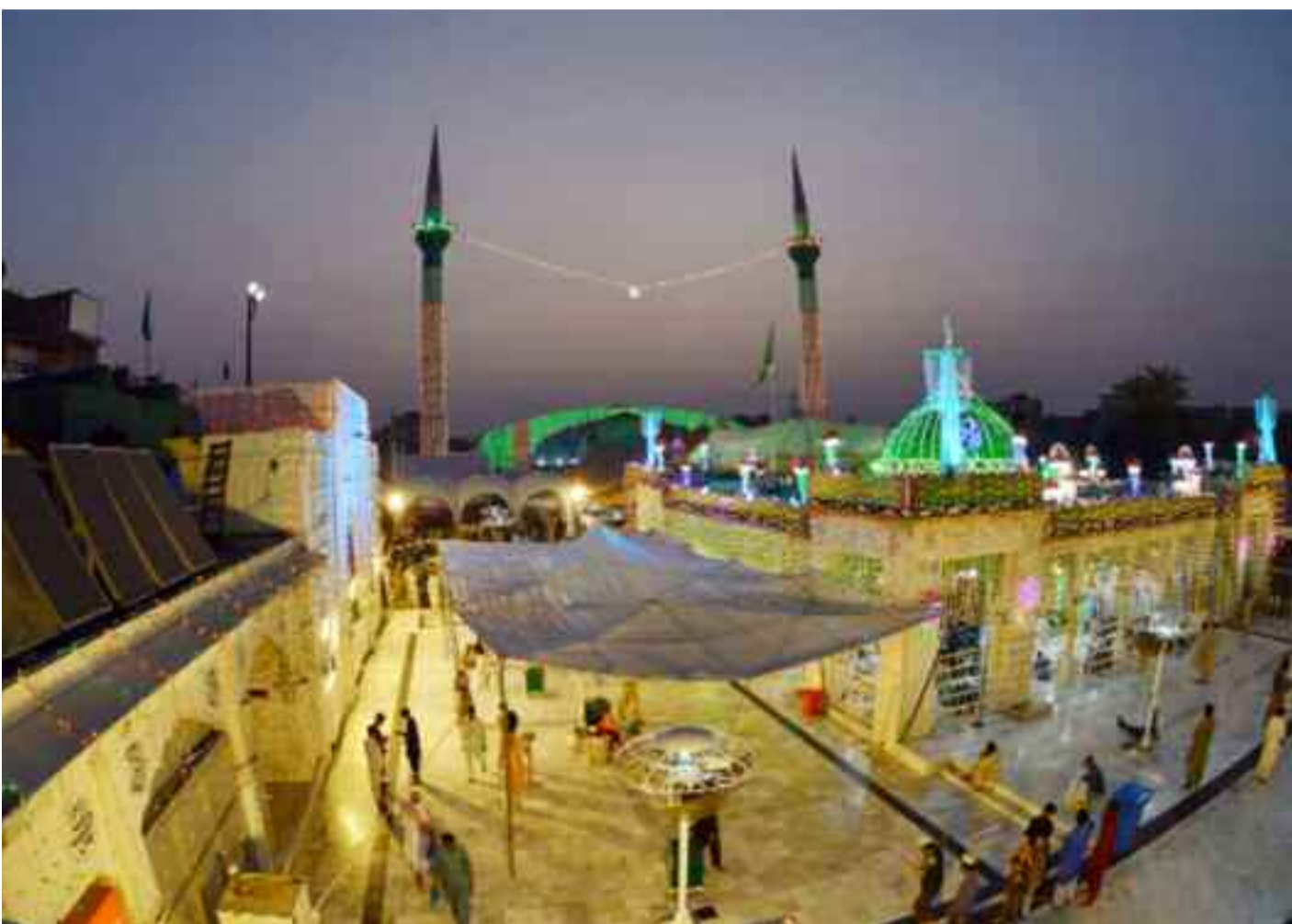
LAHORE: An illuminated view of Data Darbar decorated with colorful lights in connection with 979nd urs celebrations.