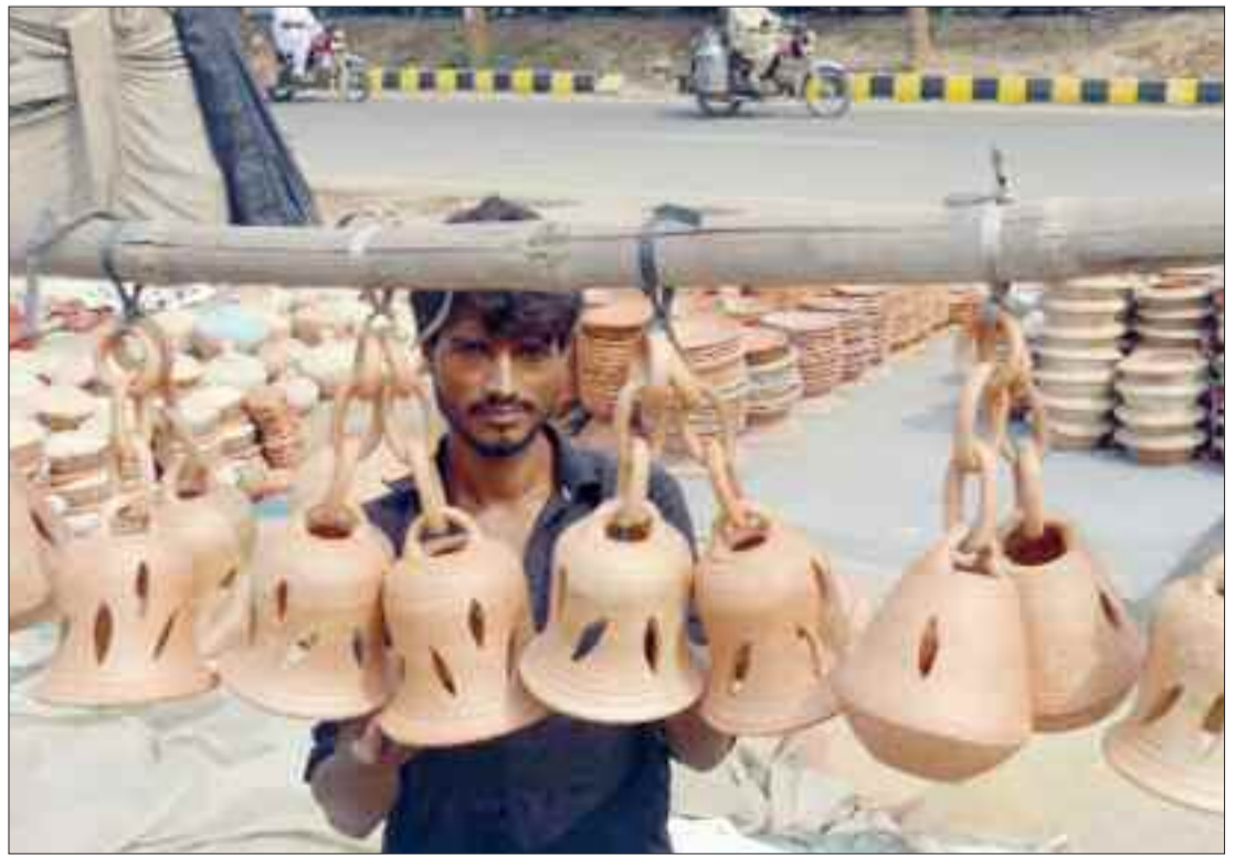
LAHORE: A vendor displays clay bells for customer attraction alongside a road at Johar Town.