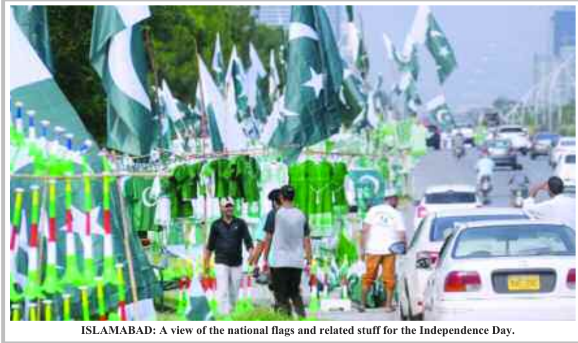
ISLAMABAD: A view of the national flags and related stuff for the Independence Day.

PTI Senior Vice President Fawad Chaudhry Saturday warned the government against raiding Bani Gala, saying that if it resorts to the move, then Jati Umar and the