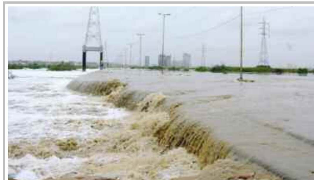
KARACHI: A view of overflowing Korangi River after heavy monsoon rain.

The rain is wreaking havoc in the country, especially in Balochistan and KP.