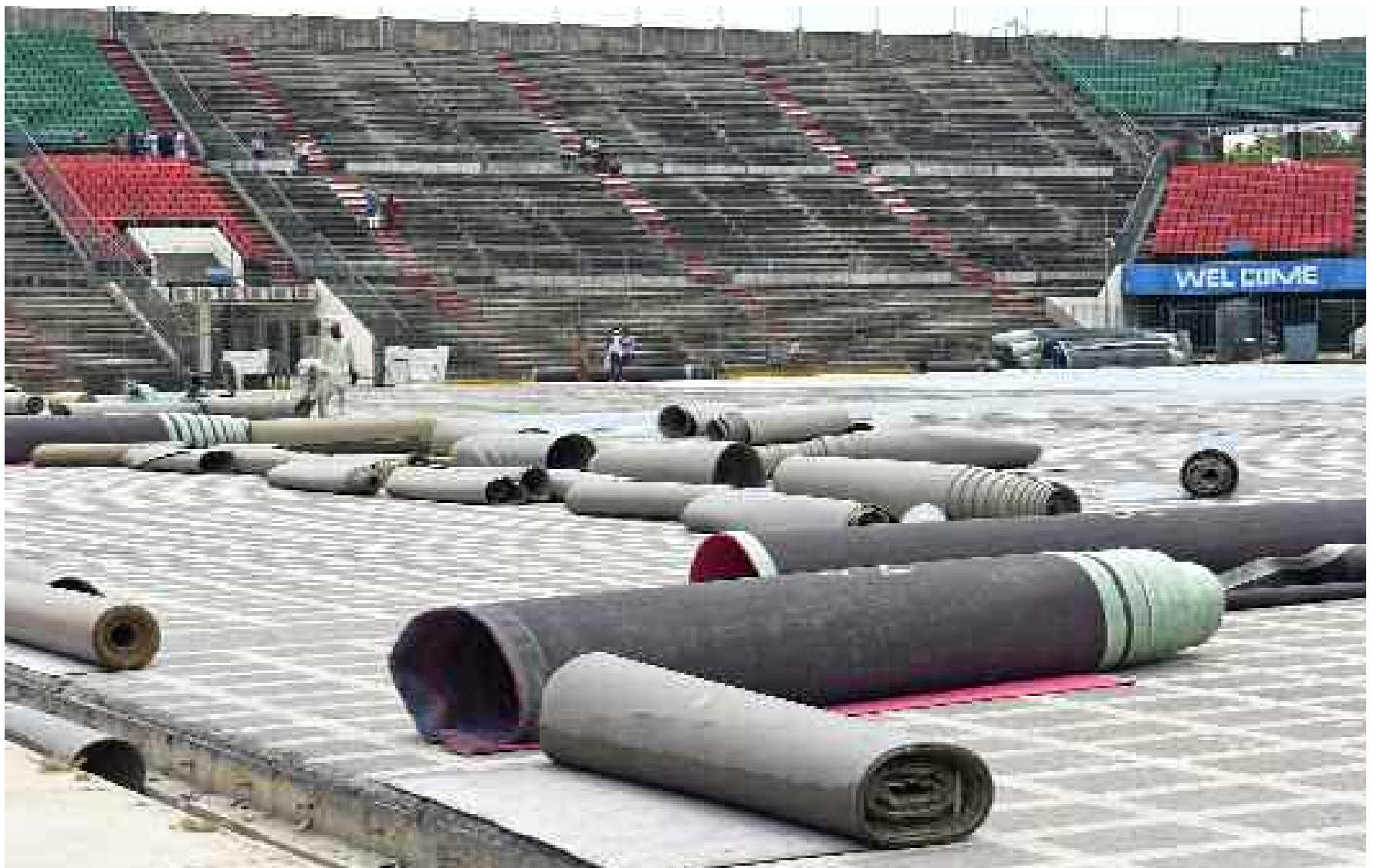
LAHORE: Workers remove Astroturf from National Hockey Stadium for the PTI public gathering (Jalsa) to be held on August 13

The minister briefed about the structure, working, legal and financial issues of the company. While addressing the participants, the provincial minister assured his cooperation for resolving the problems. Moreover, he directed the officers and officials to observe office timings. All employees must work hard as incompetency and negligence will not be tolerated, he added. Shield was