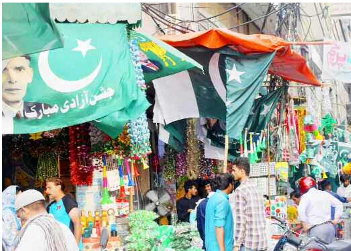
LAHORE: People buy national flags and other items to celebrate upcoming Independence Day.

Governor Punjab Muhammad Balighur Rehman said that the strength of the economy bolsters with the promotion of economic activities. The Governor of Punjab said that as Chancellor, it is his priority that consortiums should be formed in universities to solve various problems including environment. He also emphasized that information technology should be promoted, which will strengthen the country's economy. Meanwhile, Punjab Governor Muhammad Balighur Rehman said in his message on Kashmir Exploitation Day (Youme Istehsal e Kashmir) that he salutes the sacrifices and long struggle of Kashmiris for their right to self-determination.