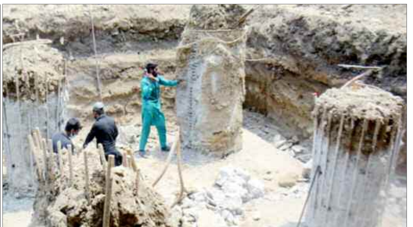
LAHORE: Labourers busy in construction work of a bridge.