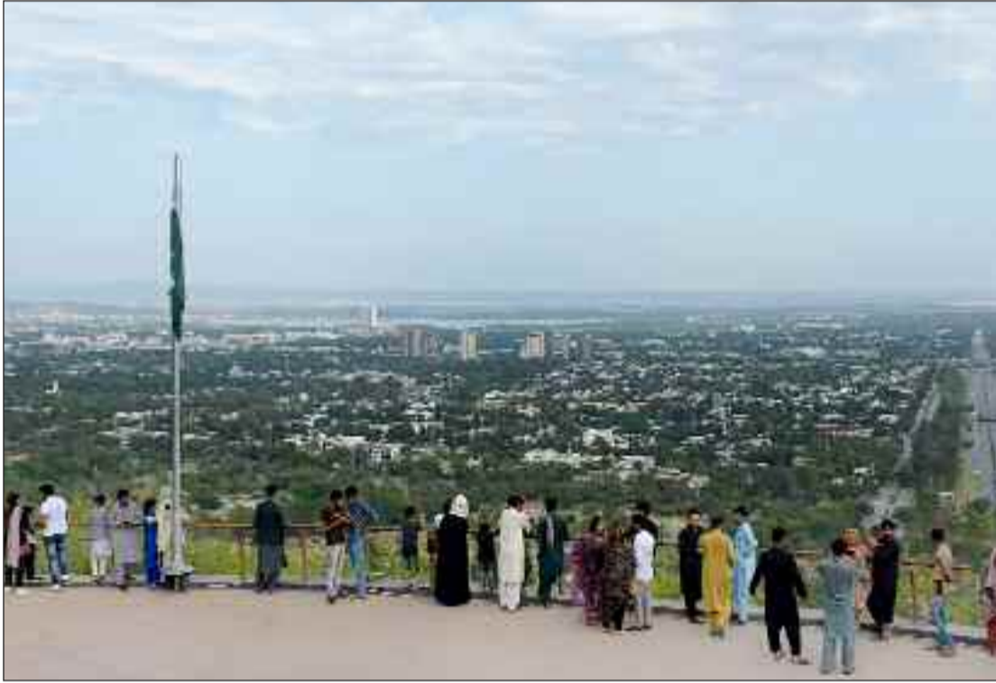
ISLAMABAD: People enjoy during pleasant weather at Damn-e-Koh.

visitors will embark on a journey into tomorrow without losing sight of the past and present. APP Quetta Metrological Centre warns flood in northeast Balochistan The Metrological Center Quetta on Friday said that thunderstorms with isolated heavy falls are expected in the northeast Balochistan that may generate flood-like situations in its catchment areas. "Heavy downpour is expected in Sherani, Zhob, Musakhel, Qila Saifullah, Loralai, Duki, Barkhan, Kohlu, Bolan, and its surrounding areas during the evening," said the MCQ referring to the weather forecast for next 24 hours. However, dusty/dust rising winds are also expected in central and southern parts of the province. Heavy falls may generate floods in the catchment areas of Northeast Balochistan. After the introduction of this system from June 17 to June 20, dusty winds have started blowing in Pak-Iran and Pak-Afghan border areas. An alert has been issued by the PDMA for the Deputy Commissioners of the districts under the expected system. The PDMA directed the Deputy Commissioners of the concerned districts to keep the necessary staff ready during the rains. The PDMA has also issued flood warnings for Lower Balochistan along with Takhte-e-Salman and Harnai Range. —APP