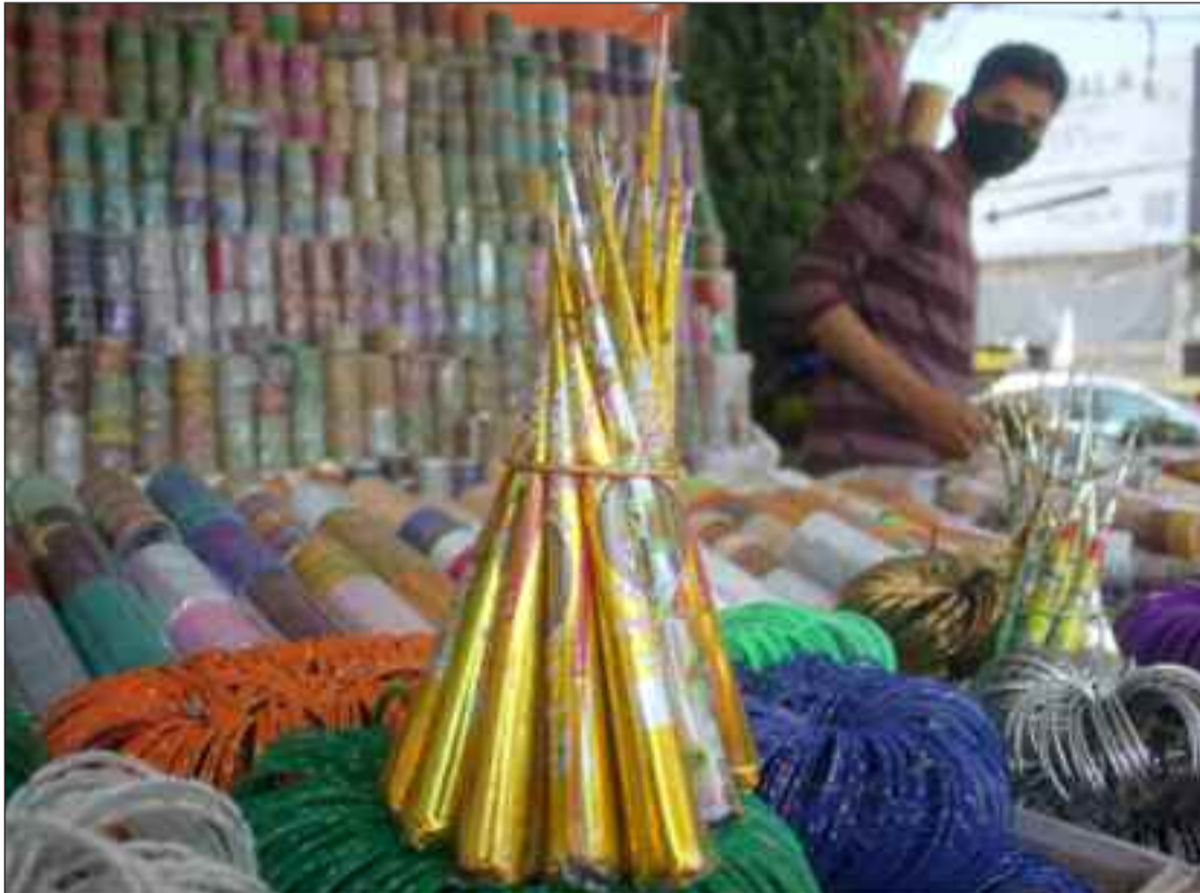
ISLAMABAD: A vendor displays hina packets at his roadside set-up.

showed people trying to pull fences down. "Isn't this a fire hazard?" asked another Weibo user. Many of the fences were erected around compounds designated "sealed areas" — buildings where at least one person tested positive for Covid-19, meaning residents are forbidden from leaving their front doors. It was not clear what prompted authorities to resort to fencing. A notice on Saturday from one local authority shared online said it was imposing "hard quarantine" in some areas. Shanghai is China's most populous city and most important economic hub. It is battling the country's biggest Covid-19 outbreak since the coronavirus first emerged in Wuhan in late 2019 with a policy that forces all positive cases into quarantine centres. The lockdown, which for many residents has lasted over three weeks, has fuelled frustration over lost wages, family separation and quarantine conditions as well as access to medical care and food. Supermarket Freshippo, backed by Alibaba Group Holding Ltd, said on Sunday it was adding couriers to meet demand in the city. —Reuters