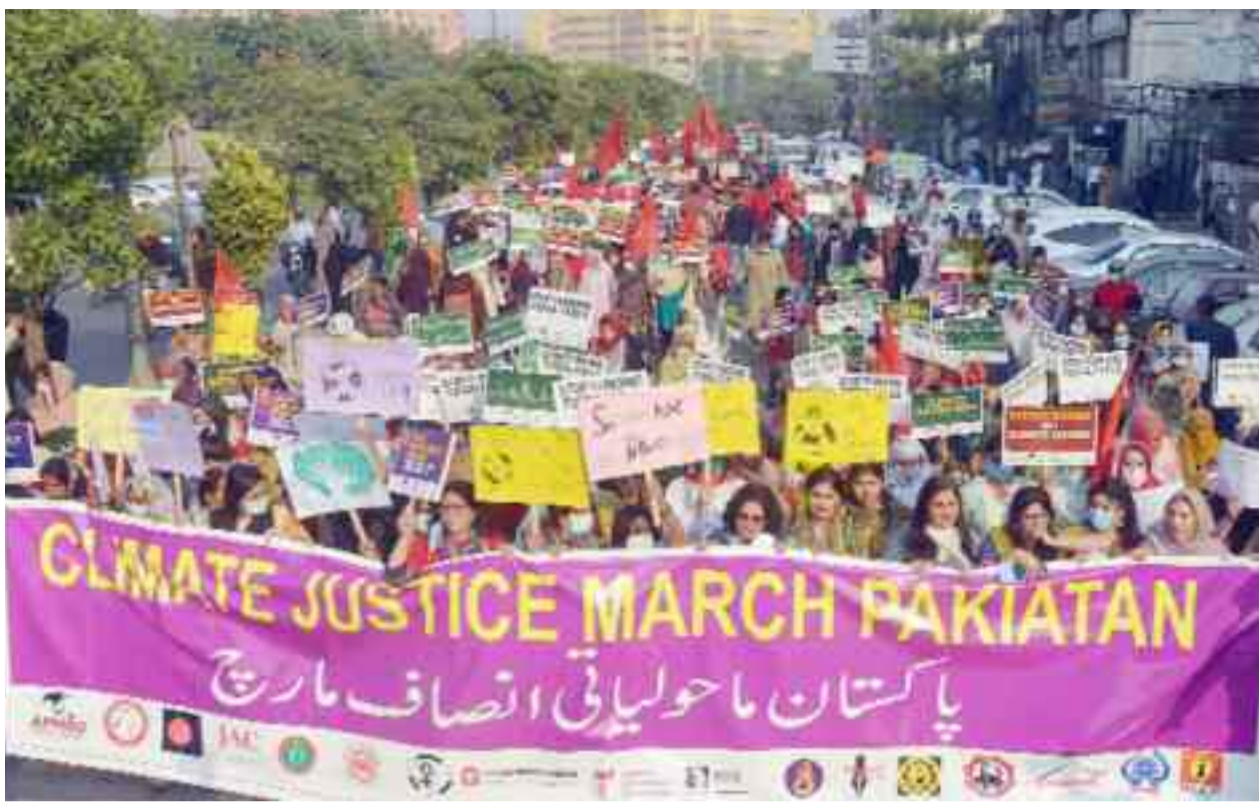
LAHORE: Activists of civil society hold placards during the rally of Kissan Rabta Committee entitled "Pakistan Environmental Justice March" from the Lahore Press Club to the Aiwan-e-Iqbal.