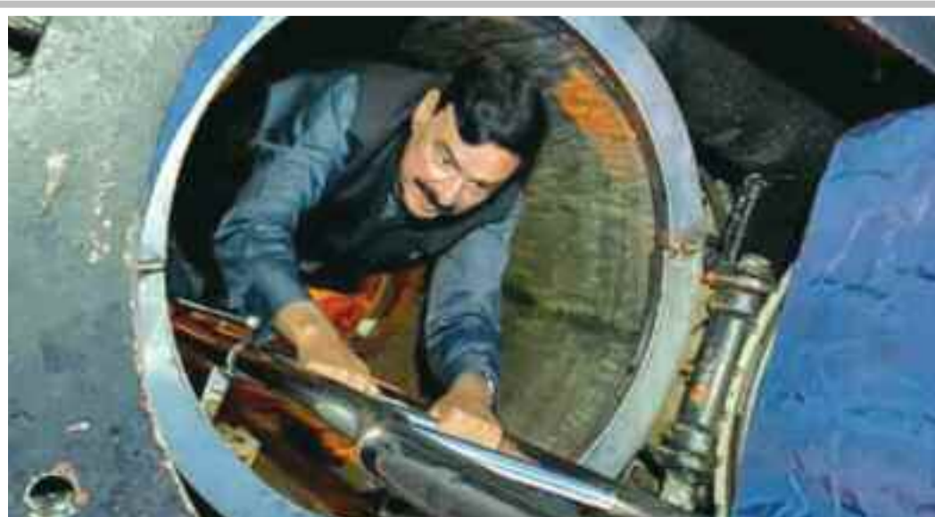
KARACHI: Interior Minister Sheikh Rashid Ahmed enters Pakistan Navy submarine named Hamza at the Pakistan Navy Dockyard.

According to the currency expert, the rupee showed strength on Friday last following the State Bank of Pakistan imposed import restrictions. Last week, the central bank imposed a 100 percent cash margin requirement on the import of additional 114 items. —TLTP