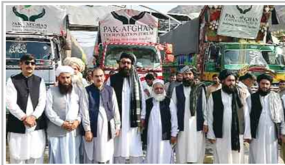
TORKHAM: Government of Pakistan hands over 15 trucks of food aid to Afghan authorities at the Torkham Border.

According to the ambassador, the 174 tons included 140 tons of flour, 16 tons of sugar and 18 tons of rice.