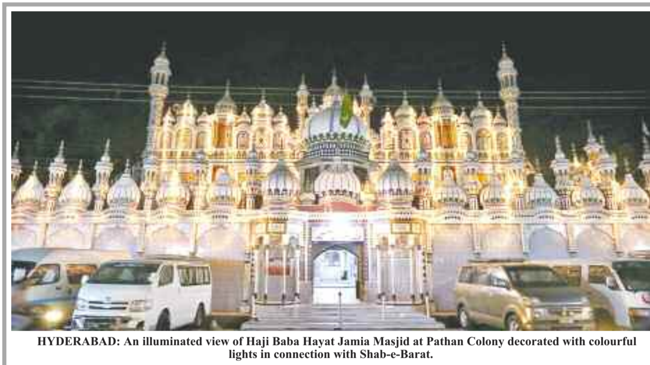
HYDERABAD: An illuminated view of Haji Baba Hayat Jamia Masjid at Pathan Colony decorated with colourful lights in connection with Shab-e-Barat.

The maximum ventilators were occupied in four major areas including Multan 70 percent, Islamabad Capital Territory 62 percent, Gujranwala 60 percent and Lahore 55 percent. The maximum Oxygen beds (alternate oxygen providing facility other than ventilator administered as per medical requirement of COVID patient) was also occupied in four major areas of Gujrat 98 percent, Gujranwala 85 percent, Peshawar 78 percent and ICT 56 percent. Around 388 ventilators were occupied elsewhere in the country while no COVID affected person was on ventilator in Azad Jammu and Kashmir (AJK), Gilgit Baltistan (GB) and Balochistan. Some 45,656 tests were conducted across the country on Saturday, including 9,424 in Sindh, 19,377 in Punjab, 8,160 in Khyber Pakhtunkhwa (KP), 6,460 in Islamabad Capital Territory (ICT).