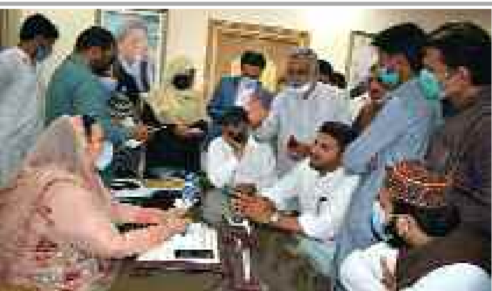
SIALKOT: Special Assistant to Punjab Chief Minister for Information Dr Firdous Ashiq Awan listens problems of the people.

After arriving, all the 266 staff will be quarantined for 14 days before entering the construction site, a spokesman said. "At present, all the projects of PowerChina Pakistan have been operating normally. The construction has been carried out under the requirements of the State-owned Assets Supervision and Administration Commission of the State