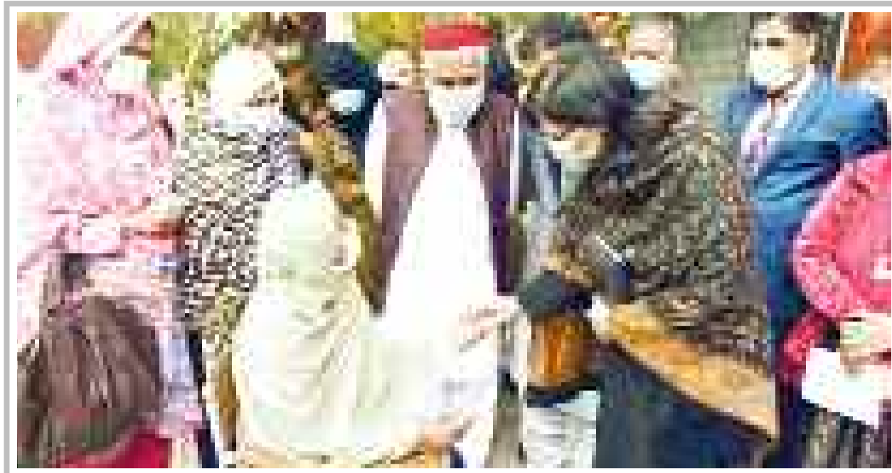
MIANWALI: Dr Sania Nishtar, Special Assistant on Poverty Alleviation and Social Safety visits Ehsaas Kafalat payment site.

Pakistan has so far conducted 5,713,341 coronavirus tests and 41,115 in the last 24 hours. 352,529 coronavirus patients have recovered in the country whereas 2,441 patients are in critical condition. There are now 52,359