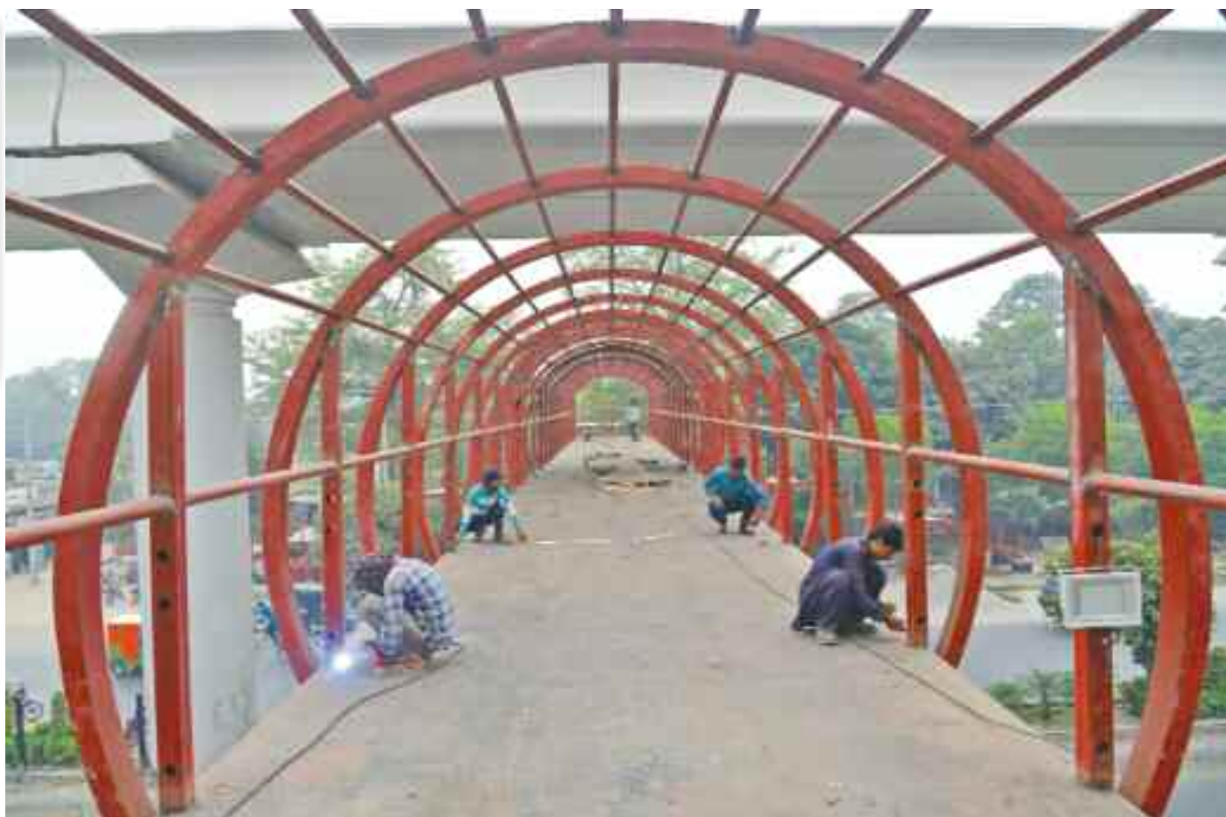
LAHORE: Labourers busy in their work at the newly constructed overhead pedestrian bridge for the students of (UET).