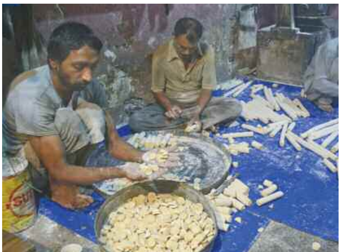
LAHORE: Workers prepare the traditional sweet Rewari , a small candy type sweet which is made by pure food items in sugar, at their work place.

He flayed opposition by commenting, "Honorable House has been made a joke by standing up and saying that the government has brought the country and the province to the brink of destruction but the Supreme Court remarked that you (N-leaguers) had brought the country to the brink of disaster."