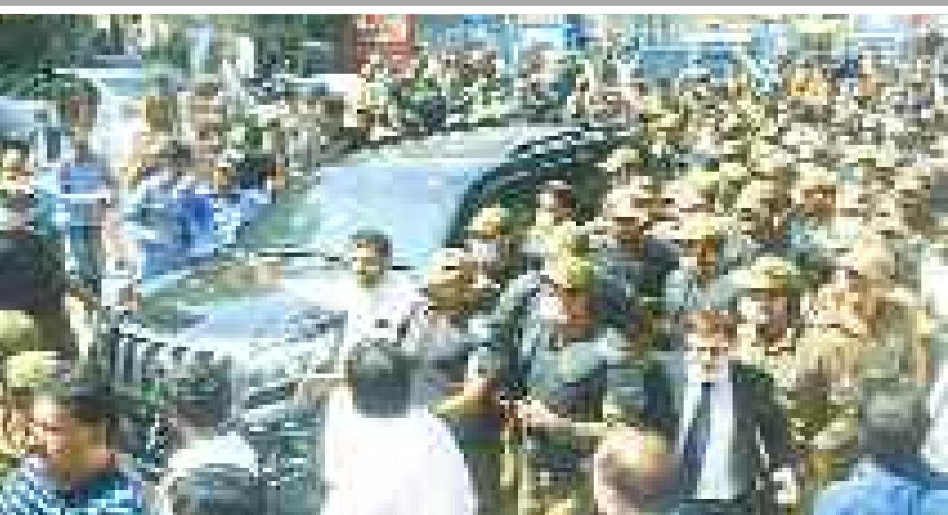
LAHORE: Officials of National Accountability Bureau (NAB) bring the Leader of the Opposition in the National Assembly Shehbaz Sharif at sessions court for the hearing of money laundering case.

He reiterated Pakistan does not want to meddle in the affairs of Afghanistan. "We have a clear message for people of Afghanistan that we have no favourite and we don't want to interfere in your internal affairs. He underlined, "We believe that only Afghan and Afghan can decide about the future of Afghanistan. Chairman of Afghanistan Reconciliation Council, Abdullah Abdullah while commending Pakistan said Pakistan played a crucial conciliatory role in Afghan peace talks. —Online