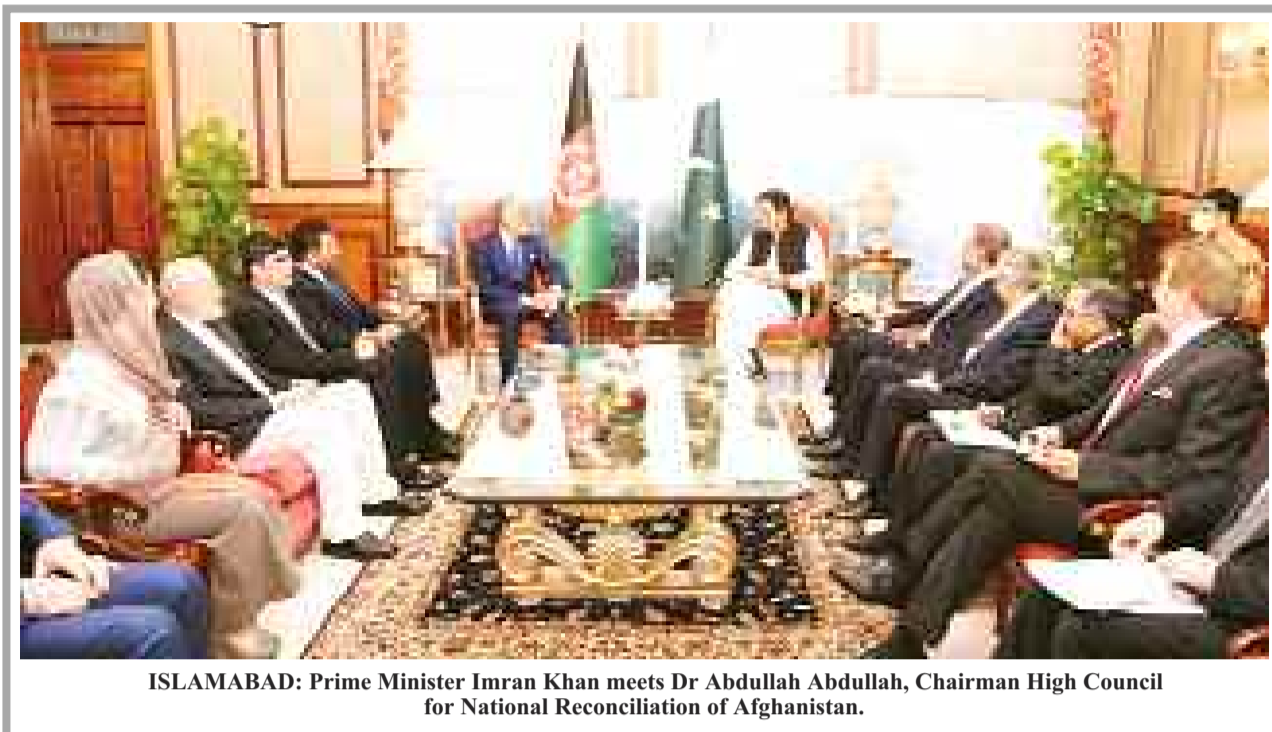
ISLAMABAD: Prime Minister Imran Khan meets Dr Abdullah Abdullah, Chairman High Council for National Reconciliation of Afghanistan.