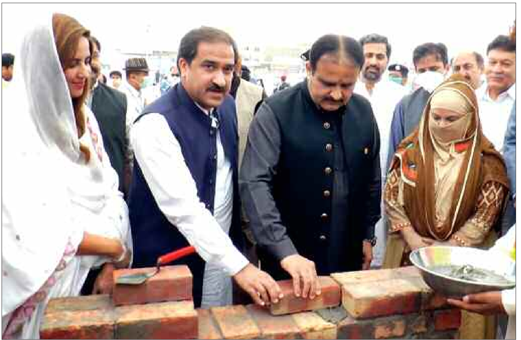
LAHORE: Punjab Chief Minister Usman Buzdar lays foundation stone of Sardar Fateh Mohammad Khan Buzdar Institute of Cardiology in Dera Ghazi Khan.

The unit price of electricity should be fixed at Rs 10 and construction of dams should be started immediately to generate cheap electricity, the chairman concluded.