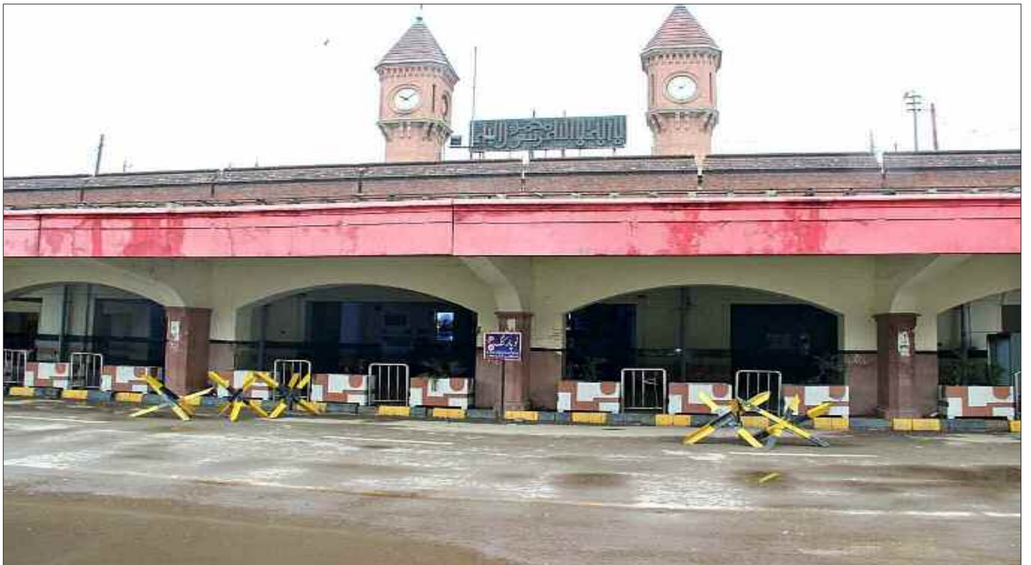
LAHORE: A deserted view of Lahore Railway Station platform as trains have been suspended till 31st.