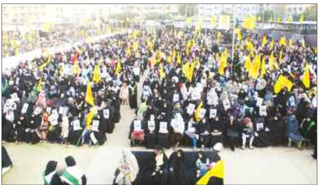
KARACHI: Activists of Majlis Wahdat-e-Muslimeen present during a ceremony titled Martyr Qasem Soleimani Conference at the Nishtar Park.

He also lauded the vision of the Prime Minister Imran Khan to empower people and making them economically sound at their door steps. He said the program is going successful and receiving good results, that is why the demand of the distribution under domestic poultry project is increasing with every passing day. He also appreciated Chief Minister Khyber Pakhtunkhwa Mahmood Khan, Jahangir Khan Tareen, Focal Person of the National Agriculture Emergency Program, Khyber Pakhtunkhwa Livestock. —Online