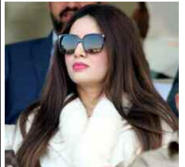
RAWALPINDI: A cricket spectator enjoys during the third day of the first cricket Test match.