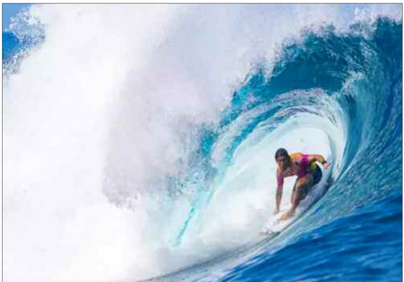
PARIS: Male surfer rides on waves.