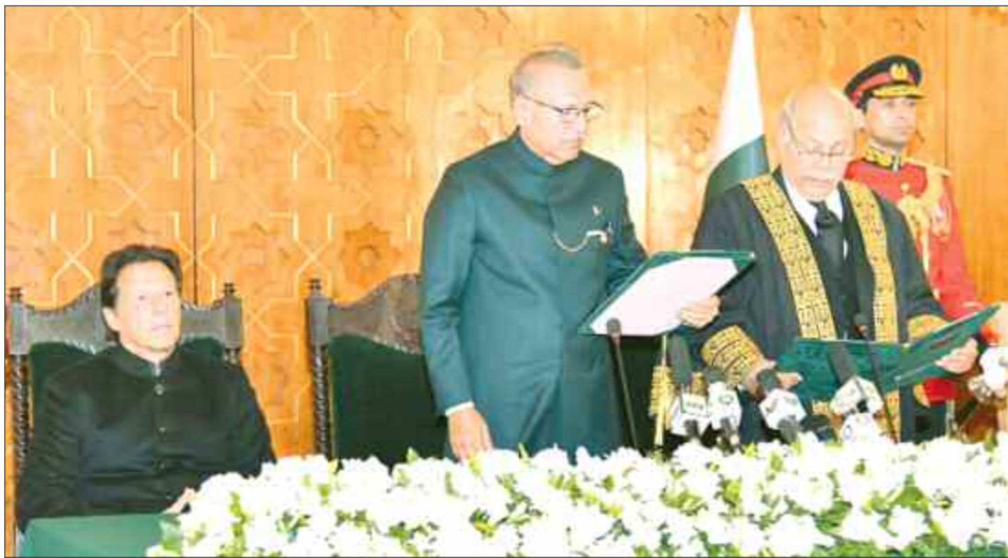
ISLAMABAD: President Dr Arif Alvi administers the oath of office to Justice Gulzar Ahmed as Chief Justice of Pakistan. Prime Minister Imran Khan is also present on the occasion.