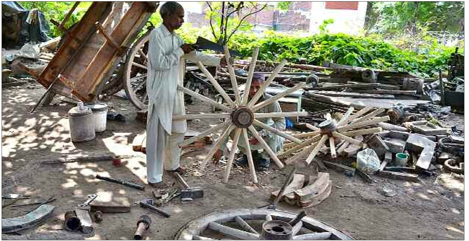
LAHORE: Workers make wooden wheel of horse cart, a traditional passenger cart.

WebOS Auto, whose origin is LG's software platform webOS that powers millions of its smart devices, is a Linux-powered IVI platform for connected car to provide the productivity and flexibility required for software development to OEM's and Tier 1's by leveraging its expertise in smart homes for the next generation of in-vehicle experience. —PR