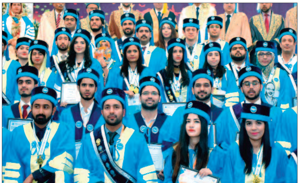
LAHORE: Governor Punjab Ch Sarwar with the position holder students at the convocation of the University of Management and Technology (UMT).

Punjab University Examinations Department has declared the results of MA History Part-II annual examination 2018. Detailed results are also available at PU website www.pu.edu.pk.